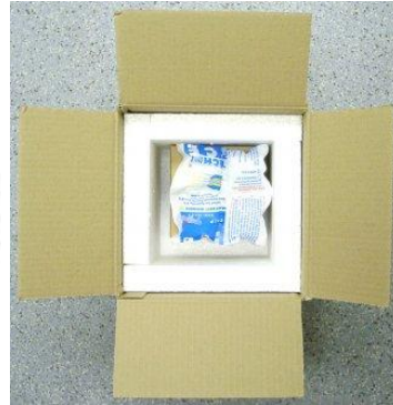
Ice Pack Shipping