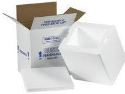
Dry Ice Shipment

We accept packages 5 days a week. See shipping type examples below.